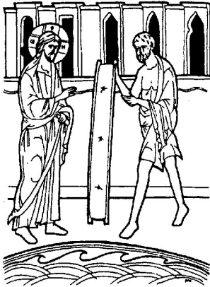
HEALING OF THE PARALYTIC

July 27, 2010 Sixth Sunday after Pentecost/Independence Day Tone 5 p. 146