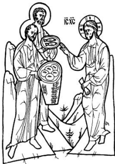
MIRACLE OF LOAVES AND FISH

I want you to see something wonderful about Jesus Christ today. Jesus knows where you are and what you're going through, and He cares .